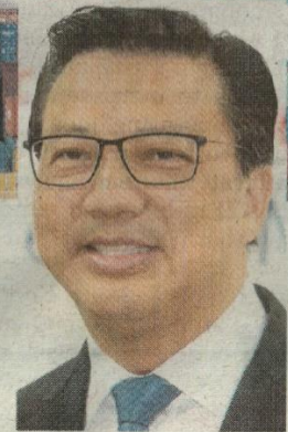
Datuk Seri Liow Tiong Lai

largest trading partner since 2009 and with the Belt and Road initiative announced in 2013, the economy of the region is expected to grow further.