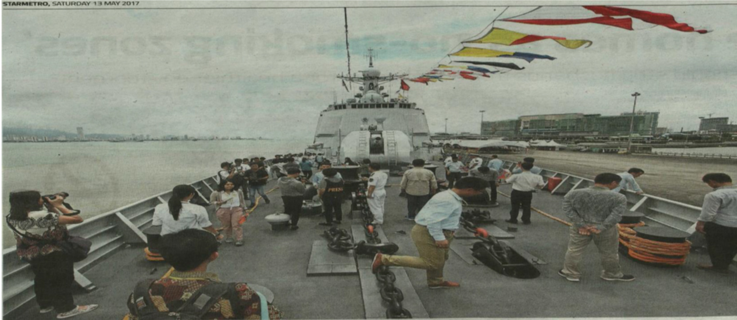
Visitors and media personnel on the deck of CNS Changchun at Penang Port's Deepwater Wharf in Bagan Luar.