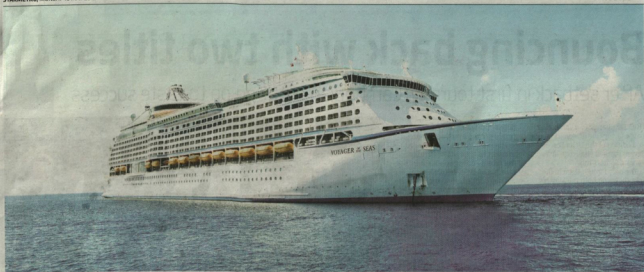
Voyager of the Seas, with a passenger capacity of more than 4,000, will be in South-East Asia for six weeks.