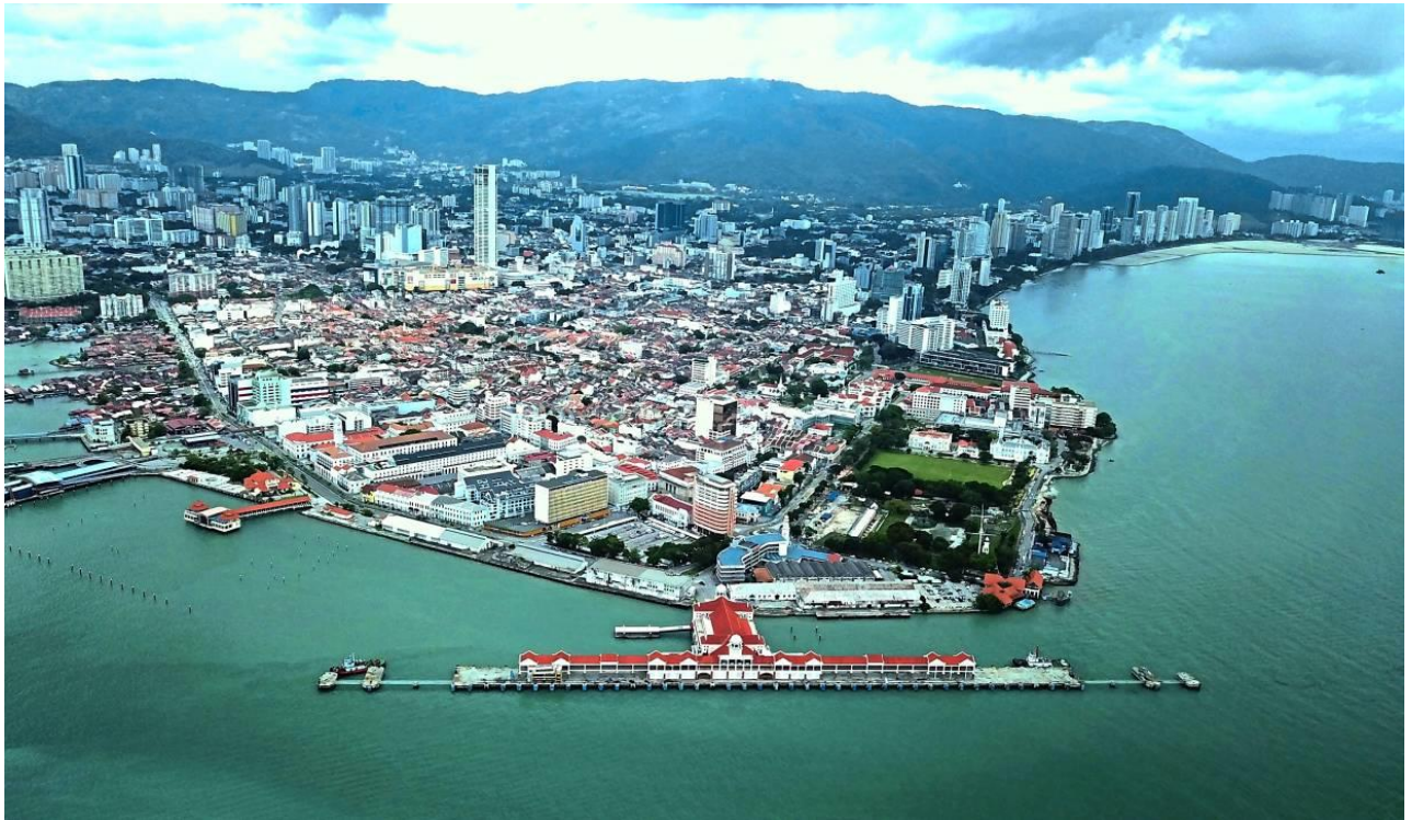
An aerial view of Swettenham Pier.

“We are unlocking the land bank with the RM155mil SPCT expansion (set to commence in the first quarter of next year) and the warehouse development, which has been given to a private company.