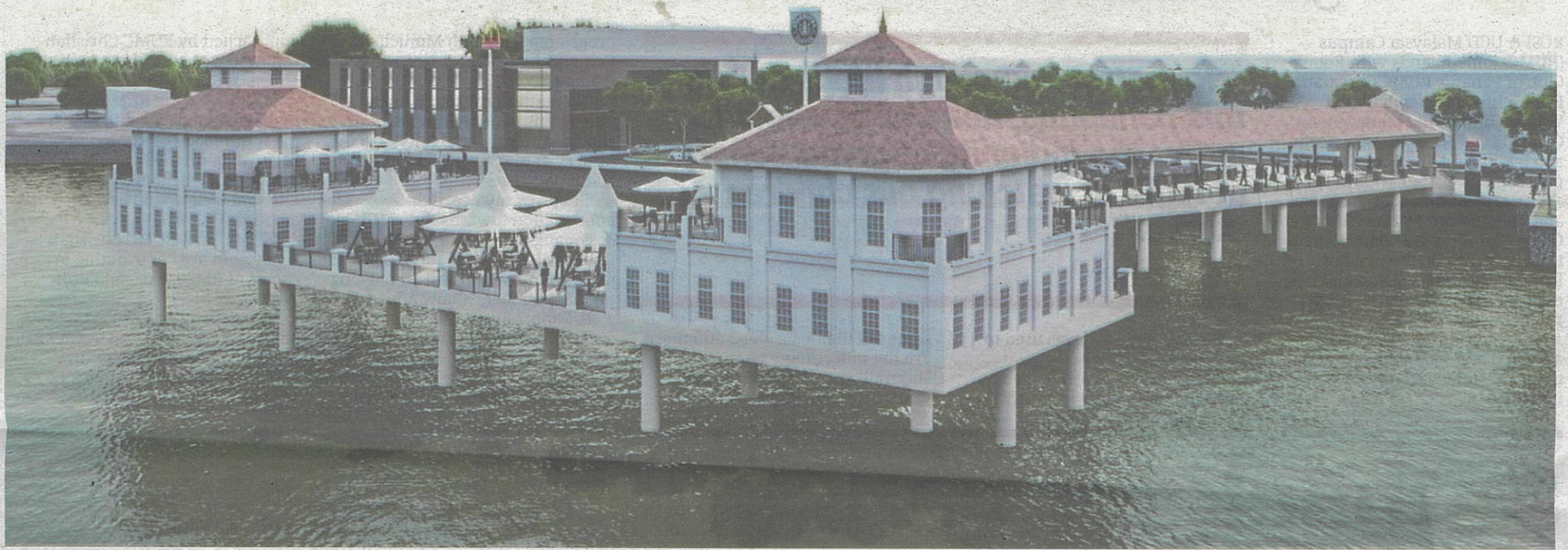
An artist's impression of signature restaurants at Weld Quay, George Town.