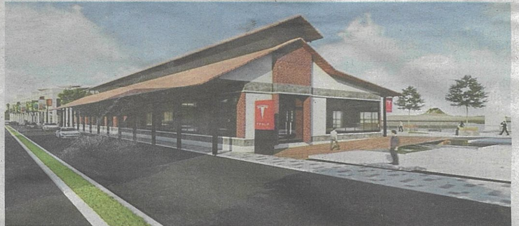
One of the warehouses will be turned into a showroom.