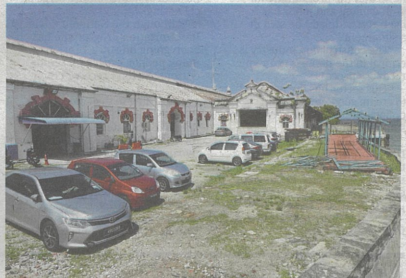
The warehouses that will be revitalised under the proposed development project at Swettenham Pier.

"PPC fully entrusts MPDT Capital to realise this development after considering its credibility and experience in implementing local