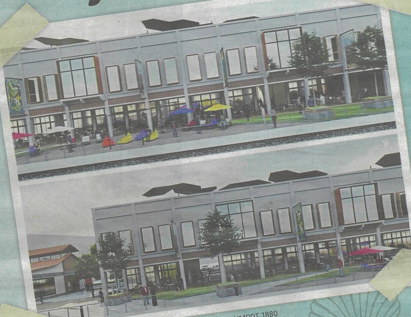
An artist's impression of the project called 'MPDT 1880 Heritage Reborn' along the seafront in Weld Quay, Penang.

Three old warehouses and part of Tanjung City Marina in George Town, Penang, will house chic restaurants, a vehicle showroom, an e-sports arena and a flight simulator training centre as well as various other recreational and entertainment facilities under a redevelopment project that is set to enrich the city as a Unesco World Heritage site. >3