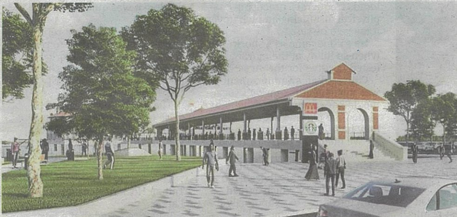
An artist's impression of the upgraded walkway near Tanjung City Marina.

The project is part of the Eastern Seafront Development (ESD) within George Town's Unesco World Heritage site.