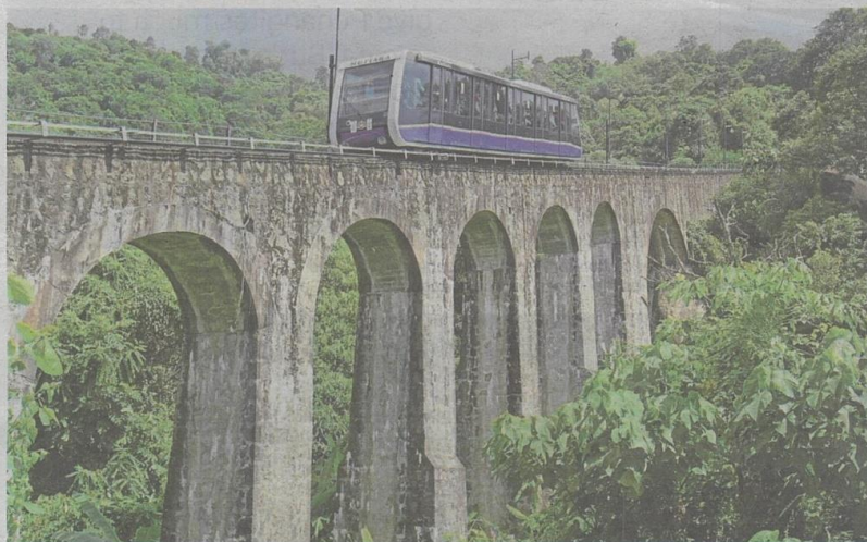
The Penang Hill cable car will complement the existing funicular railway that has been in operation for a century.

HotI is envisioned as a world-class tourist destination that seamlessly integrates leisure, commerce and community, complementing the existing George Town heritage zone.