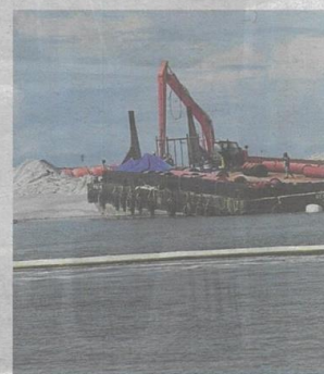
An artist's impression of the upcoming Silicon Island. (Right) Silicon Island reclamation works ongoing as of last month.

at the few affected sites where feasible.