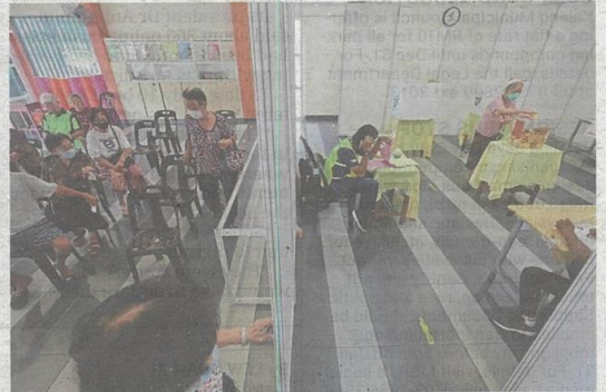
Voters casting their ballots at Ayer Itam on GE15 polling day.

In May, Prime Minister Datuk Seri Anwar Ibrahim announced that the Federal Government would set aside an allocation for Penang to have its first LRT.