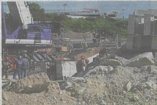
Work on the Ayer Itam-Tun Dr Lim Chong Eu Expressway bypass is underway.

access points and elevated U-turns. The bypass is slated for completion by mid-2025 and is currently halfway complete.