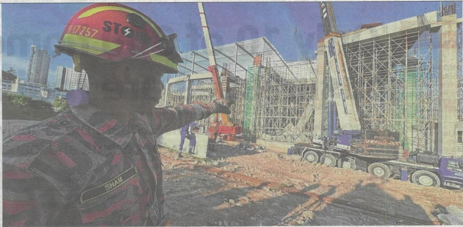
A Fire and Rescue Department officer showing the beam that collapsed in Batu Maung.