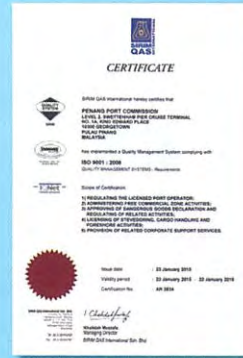
ISO 9001:2008 Quality Management System Year 2015