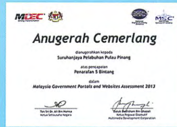
Malaysia Government Portals and Websites Assessment 2013