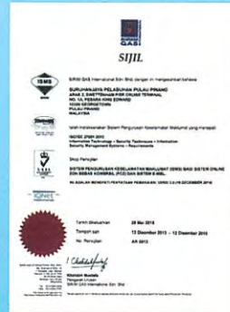
ISO/IEC 27001:2013 Information Security Management System Year 2015