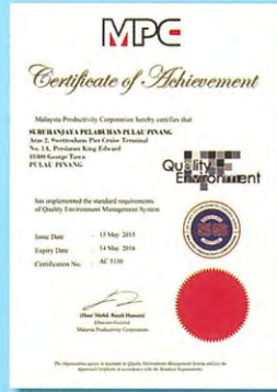
Quality Environment Management System Year 2015

In its quest for excellence, Penang Port is committed to providing competent and reliable services at par with world standards at all times.